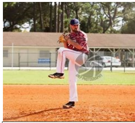
HIBBS FANS NINE