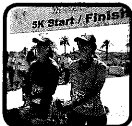
Parkinson's 5K Walk