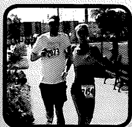
Parkinson's 5K Run