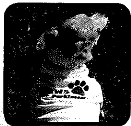
Paws for Parkinson's®