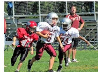
Mechanicsburg Midget Football