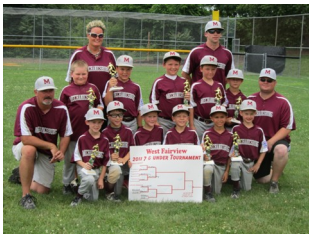
Mechanicsburg Little League

Held each year at our York Street Field, the Opening Day Ceremony is our kick-off to the MLLA game season. Each team is announced and the players have the opportunity to run on to the field with their team. This year the high sellers in our Sub & Sandwich Sale will be announced and the players and families will have the opportunity to see "Rascal" from the Harrisburg Senators. Don't forget the Opening Day "First Pitch" — PLAY BALL!