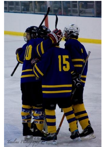
Cheyenne Capitals High School Teammates Celebrate Their 2008-2009 WAHL High School B State Championship